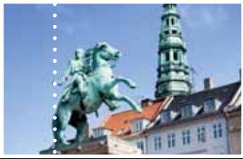
Ty Stange www.copenhagenmediacenter.com